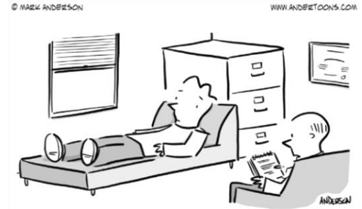
"So you had your mind blown. It happens."