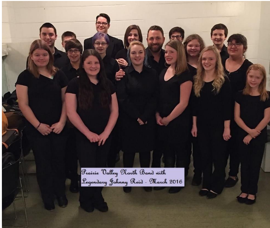
PRAIRIE VALLEY NORTH BAND WITH LEGENDARY JOHNNY REID